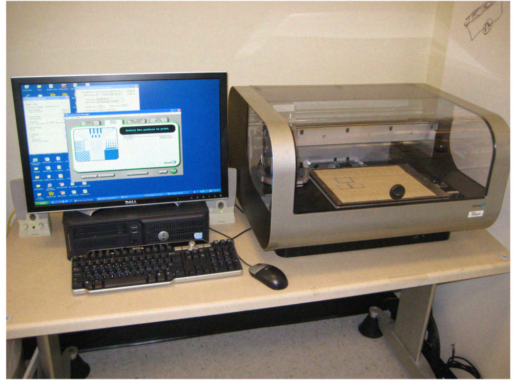
Figure 1. Photograph of Inkjet Printer