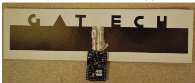
Figure 2 Inkjet-printed antenna mounted on the WISP.

Among others, this effort has shown that inkjet printing techniques perfectly match the text-based design proposed in terms of high applicability. A comparison with the normal antennas mounted on the WISP is included in [2].