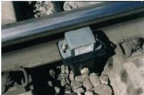
Fig.2 Magnetic steel fixed next to the railway rail

The identity of each vehicle is transmitted by a passive RFID Tag mounted underneath the vehicle, and received by