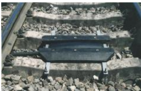
Fig. 1. RF Reader fixed between two railroad ties.

the RFID Readers mounted along the railway tracks. During the operation, the Reader is connected to the railway system